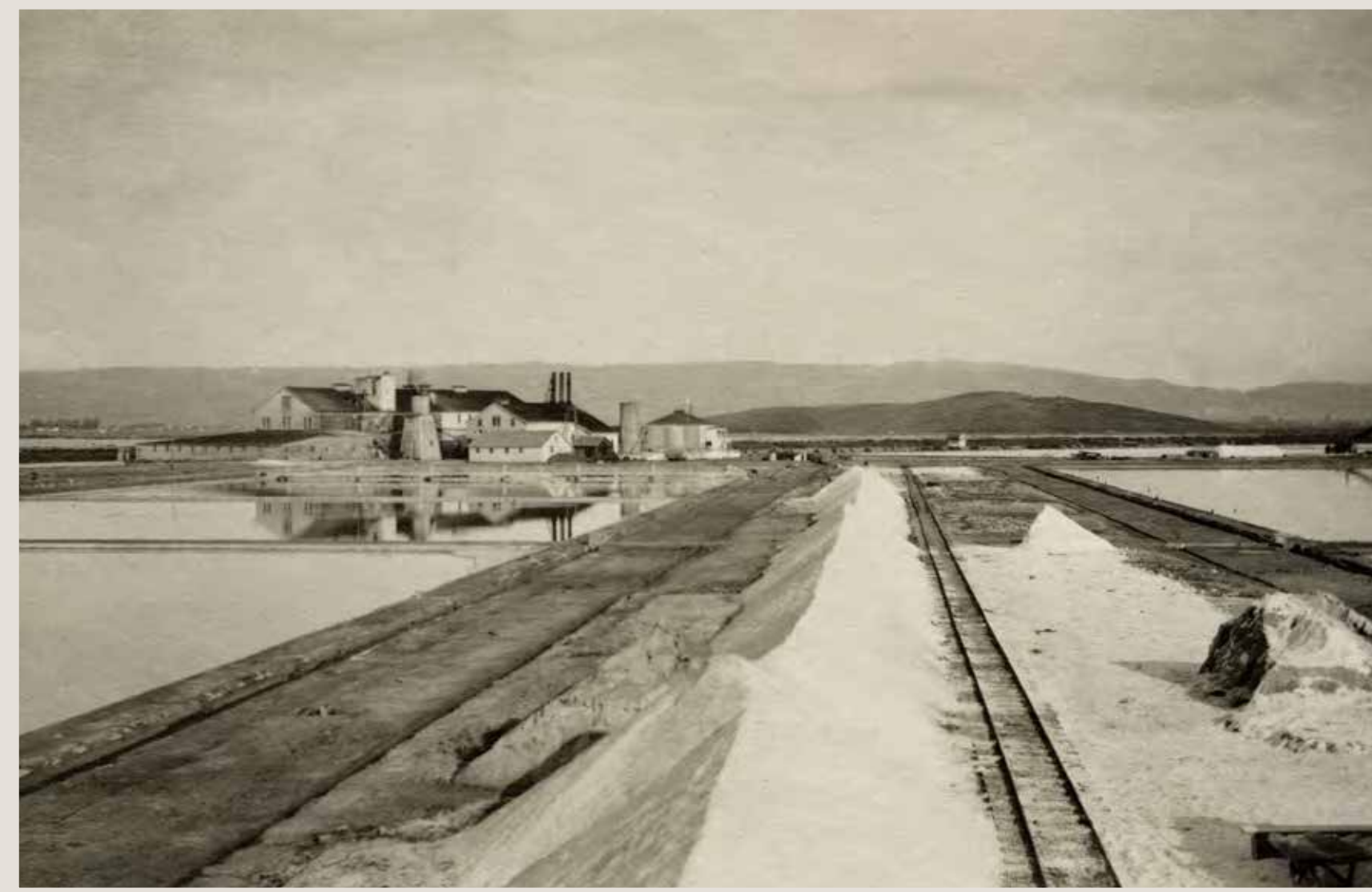
California Salt Company Refinery at the mouth of Alameda Creek 1917: as salt purity improved, California's food markets expanded.

Today, Cargill harvests 500,000 tons of salt each year, using solar and wind power to crystallize the salt from bay brines. This is one of only two coastal salt works in the entire United States.