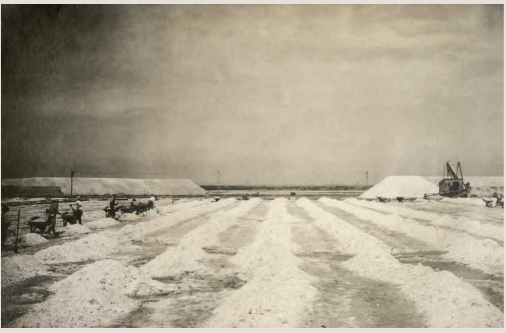
Harvesting by pick and shovel continued until 1936, when the mechanical harvester was invented.