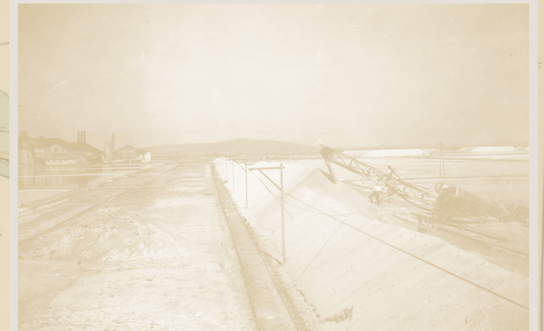
Salt was used to refine silver ore. Discovery of the Nevada silver lode drove salt demand.