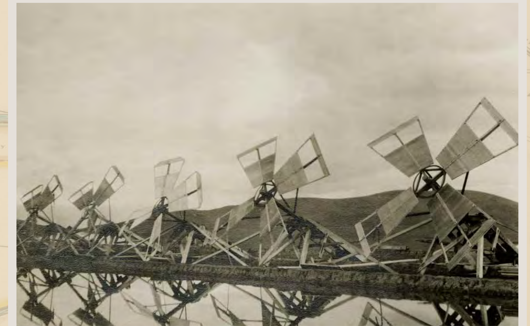
Archimedes Screw Pumps: Pioneer salt makers used these windmills to move salt brines through the salt pond system.